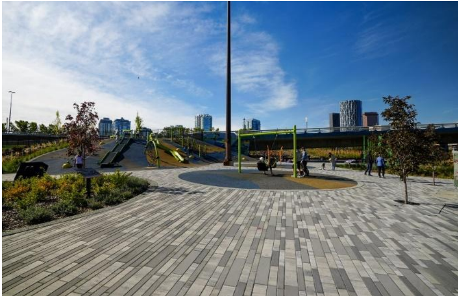
Flyover Park is a convenient 10-minute walk from Calgary's downtown core and a 5-minute walk from the Bridgeland LRT station.

Inspired by innovative urban parks that reclaim “forgotten” spaces in cities such as New York, Boston, Miami, and Toronto, Flyover Park has become a recreational hub on the edge of downtown Calgary. Once dark and sometimes dangerous, the park is now visited by Calgarians daily, forging a new way to re-imagine park spaces in urban locations.