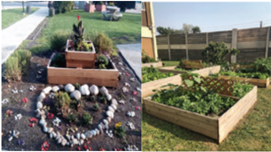
A small corner of Bridgeland's garden

Have you ever had an idea for a community project to make your community better, meet your neighbours, tackle issues in your community? Then you might consider applying for a Neighbourhood Grant offered in your community like Kari Priolo did in the community of Bridgeland.