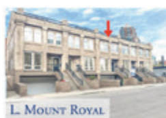
L. MOUNT ROYAL