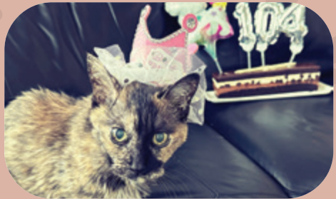
JC Cat, Evanston